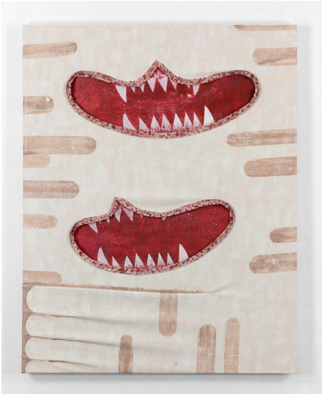
Kittens Are Like That, 2020 acrylic on canvas, thread 42 x 34 inches