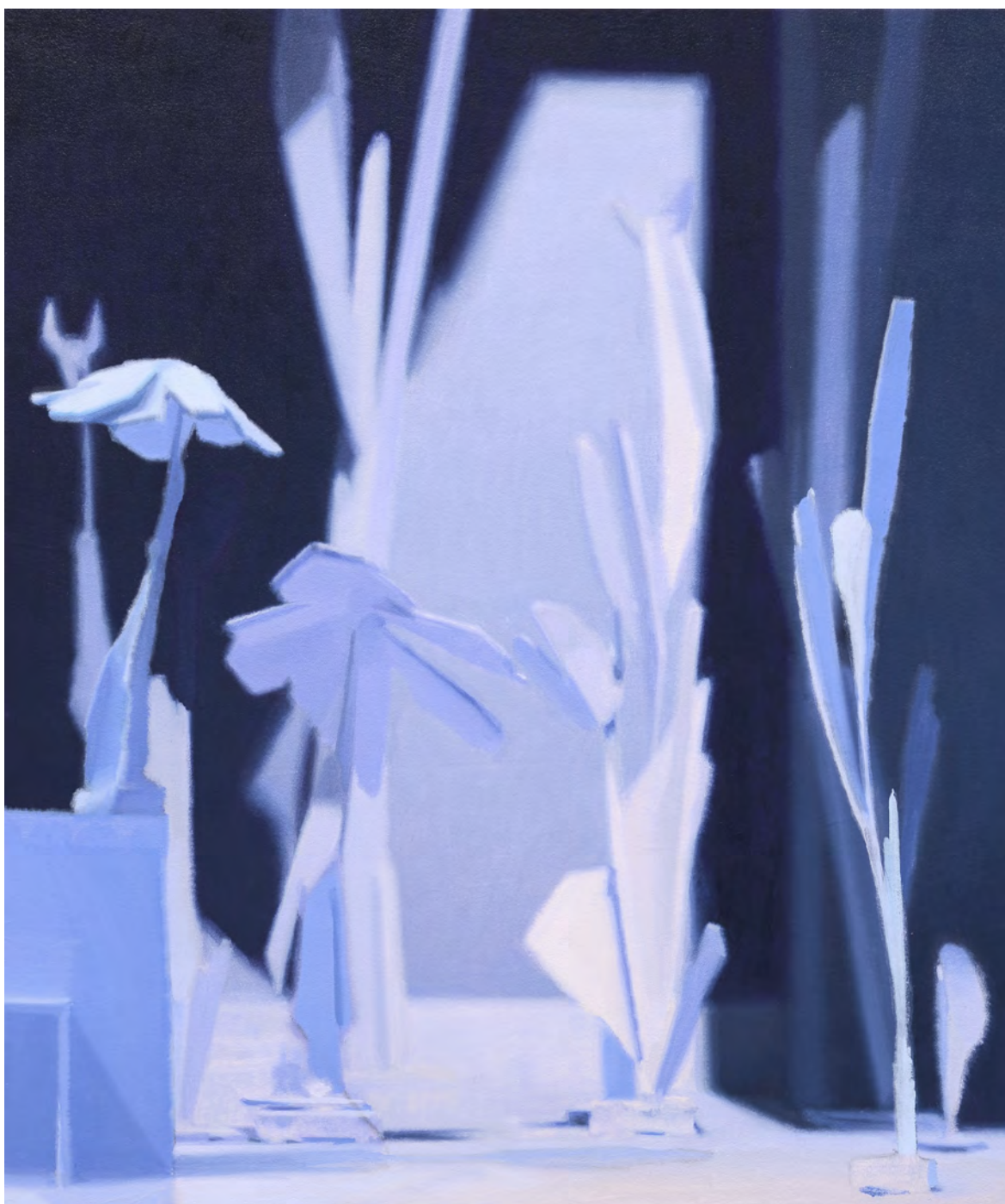
Things I could do (Ledlan) 2020 Oil on canvas 60.5 x 51cm