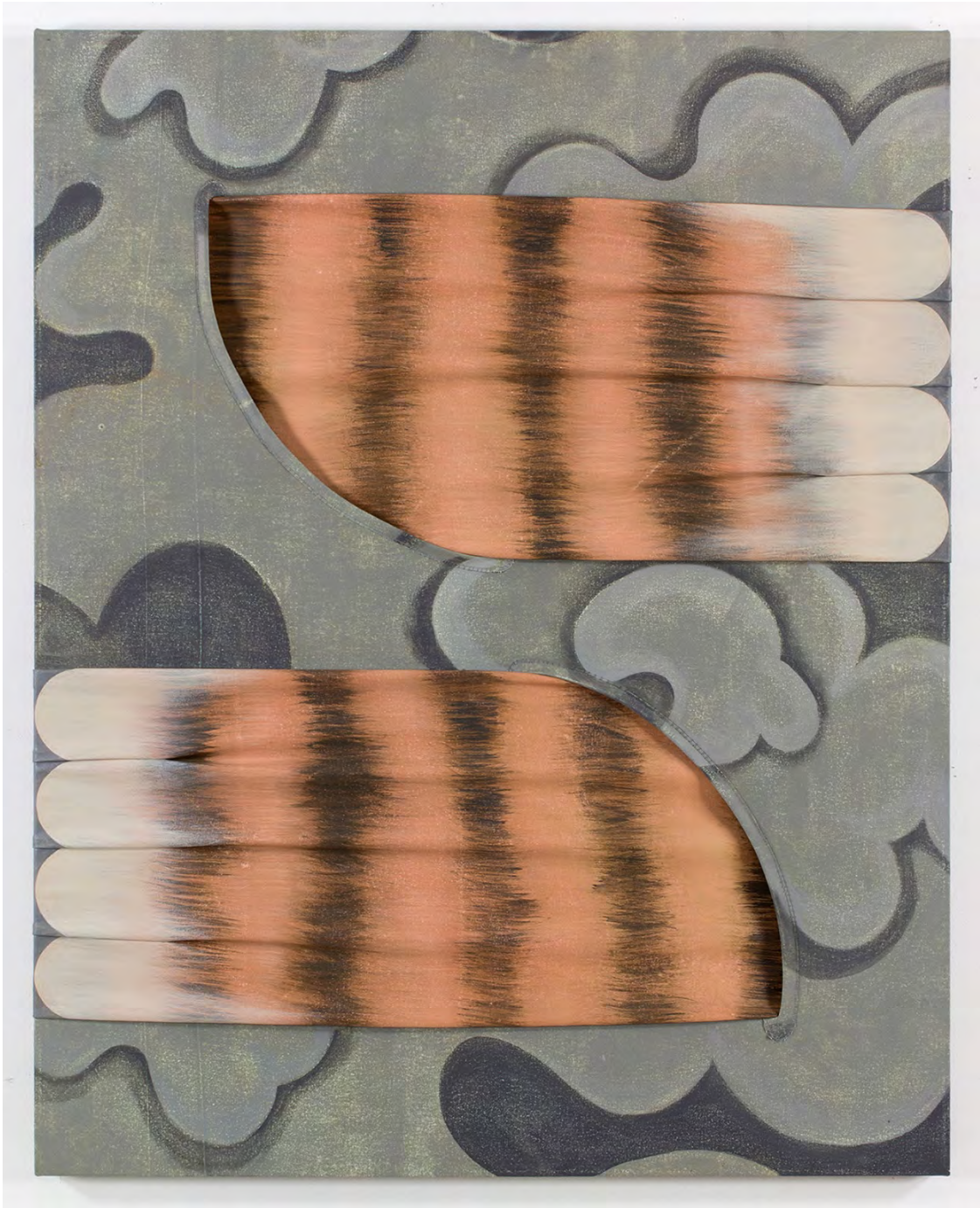
When Tigers Smoke, 2018 acrylic on canvas, thread 50 x 40 inches