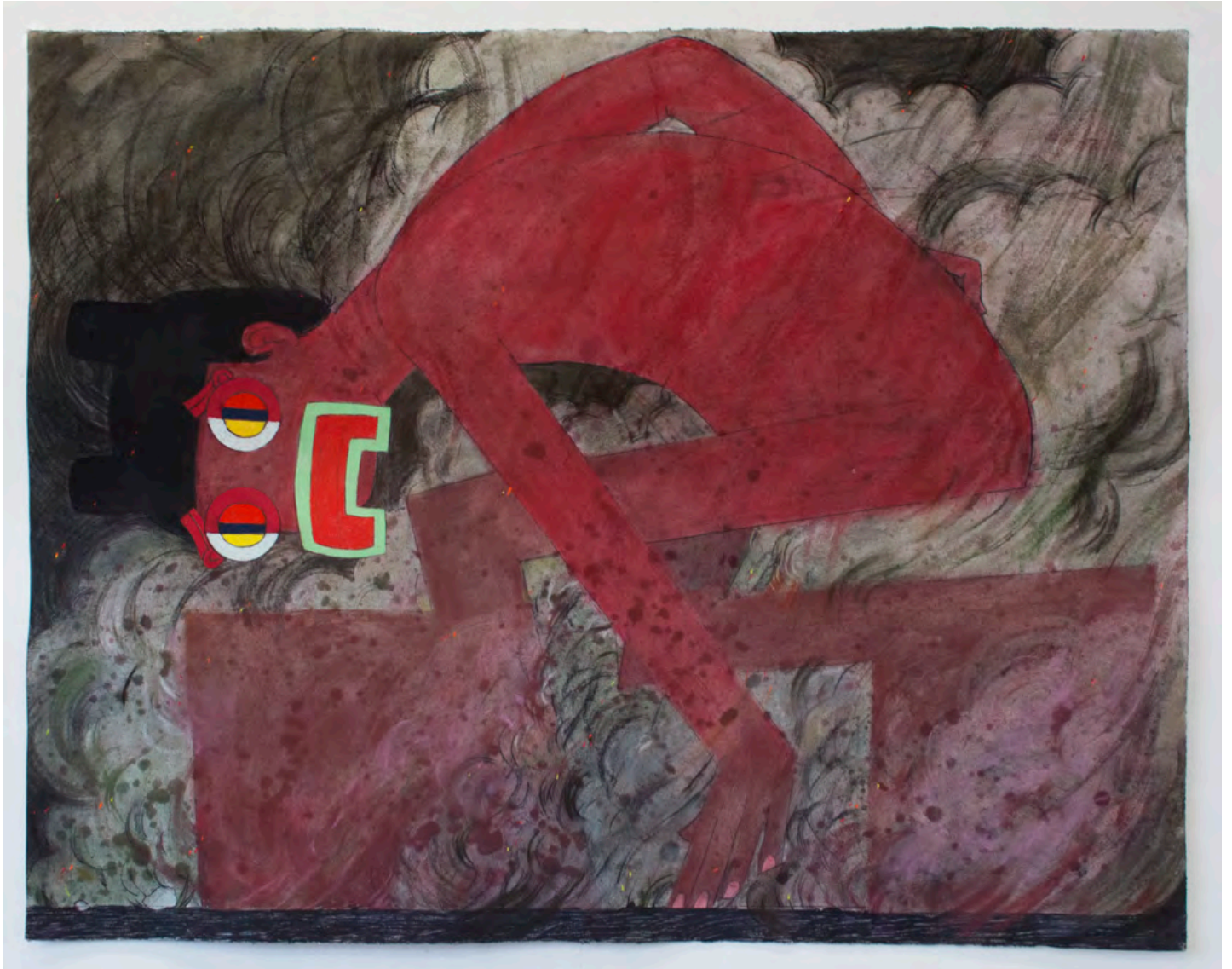
En La Calle I [On the Street I] chalk pastel, charcoal on paper 36" x 48" 2021