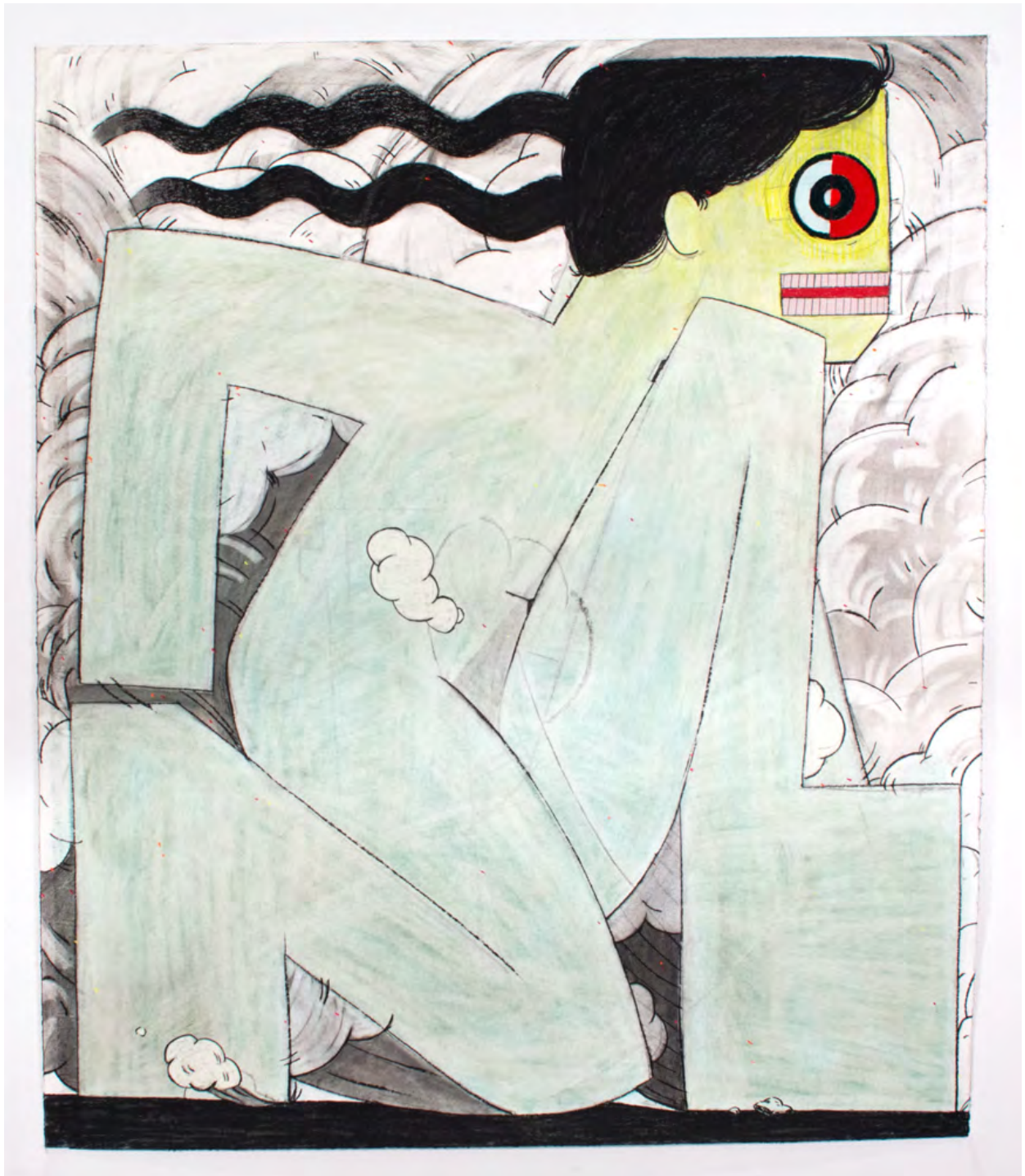
Nos Encontramos en la Calle I [We Find Ourselves/Each other on the Street I] chalk pastel, charcoal on paper 24" x 32" 2020