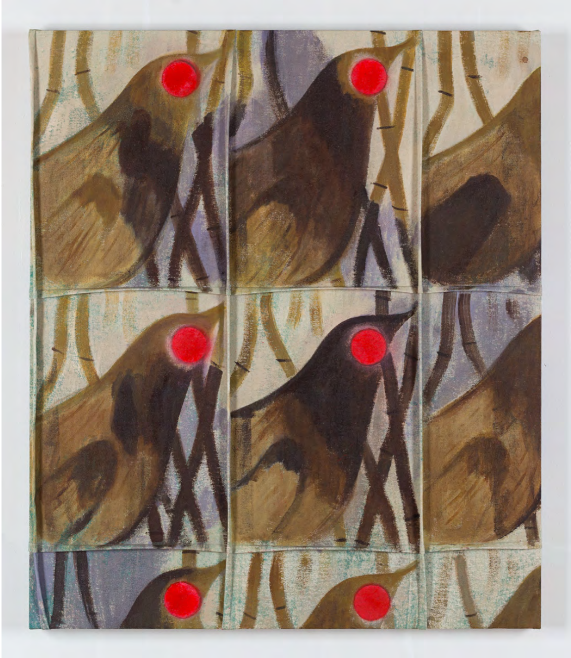
Red Sky at Night, 2023 acrylic on canvas, thread 42 x 36 inches