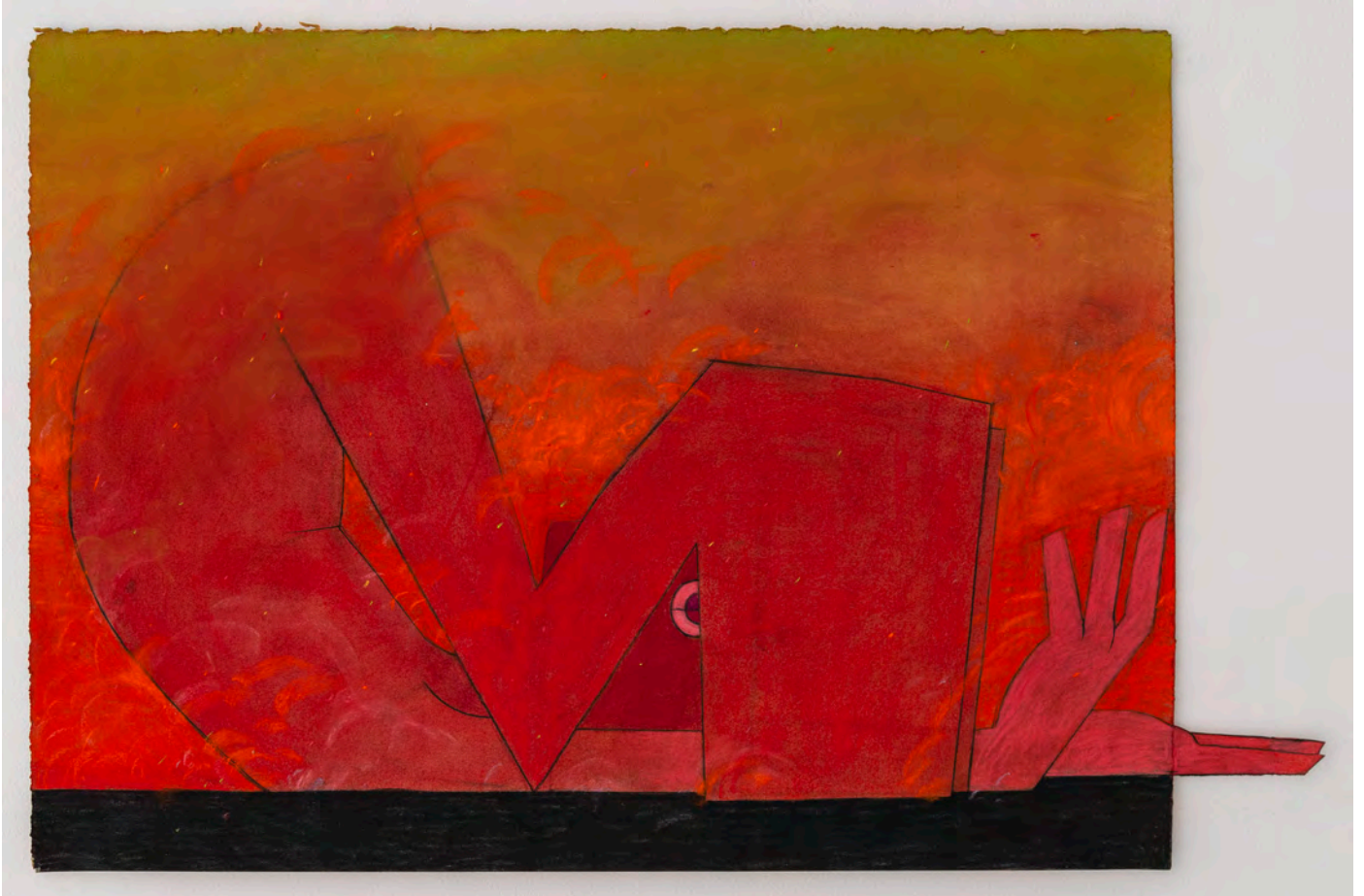
En La Calle IV [On the Street IV] chalk pastel, charcoal on paper 22" x 36" 2022