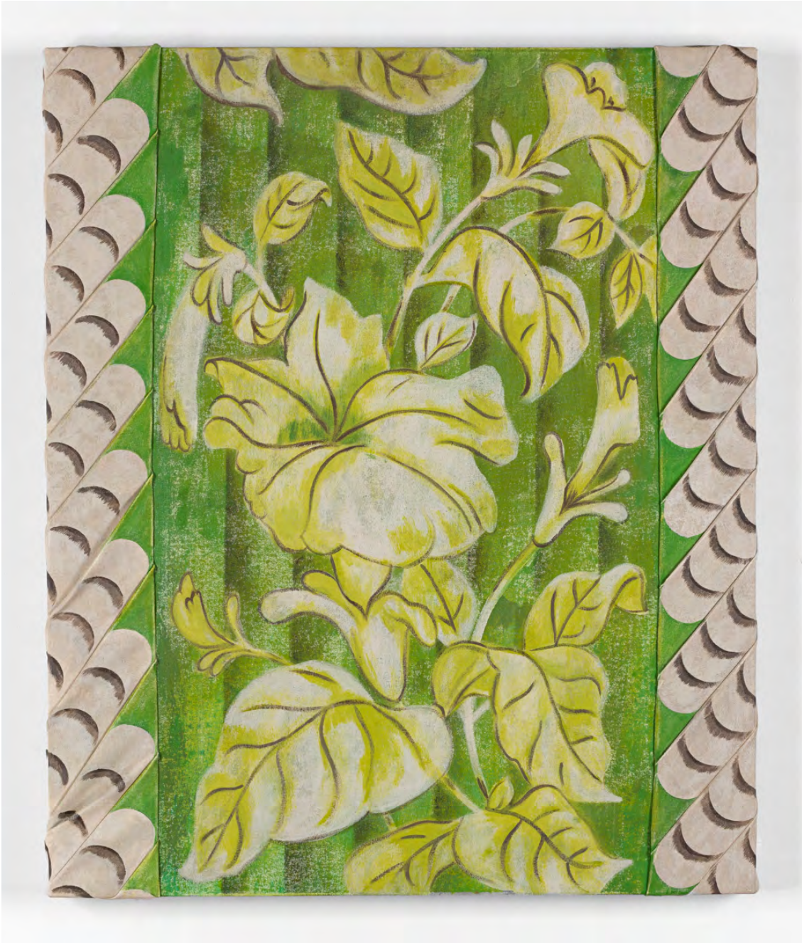
Fragrant Synthesis, 2023 acrylic on canvas, thread 36 x 30 inches