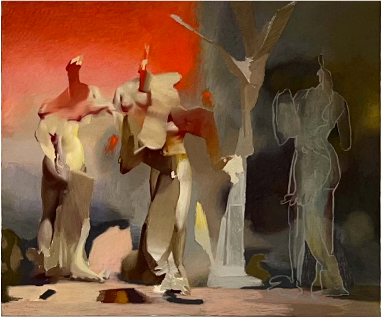
Eden IX 2023 Mixed media on paper mounted on canvas 100 x 120 cm