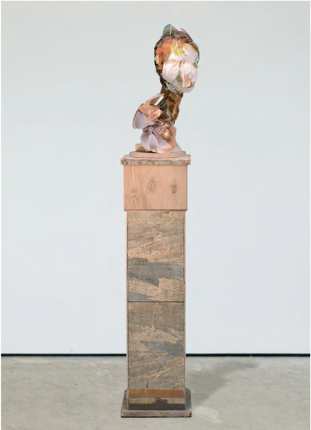
Muse XII 2023 with artist's plinth