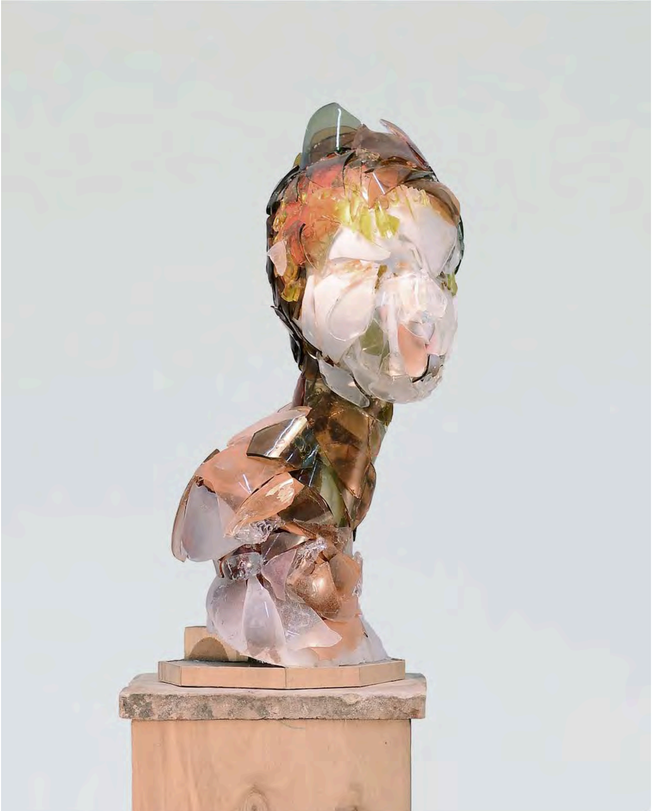
Muse XII 2023 60 x 35 x 30 cm excluding artist's plinth Mixed media