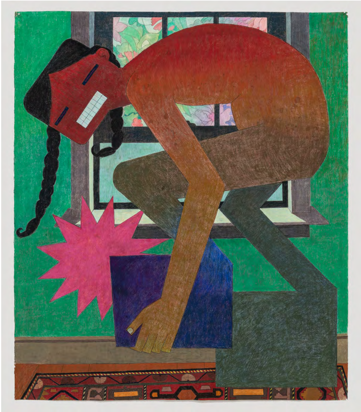
I Can't Afford to Keep on Standing chalk pastel, charcoal on paper 60" x 51" 2022