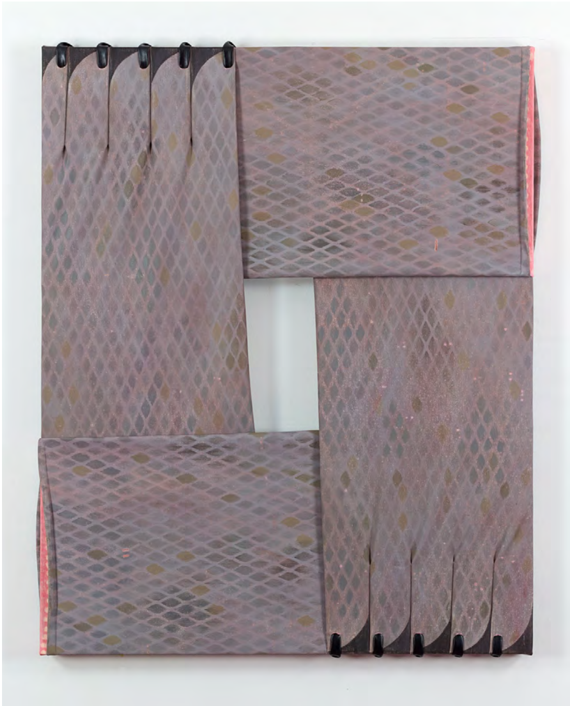
A Hole is a Home (Komodo), 2020 acrylic on canvas, thread, faux leather 42 x 35 inches