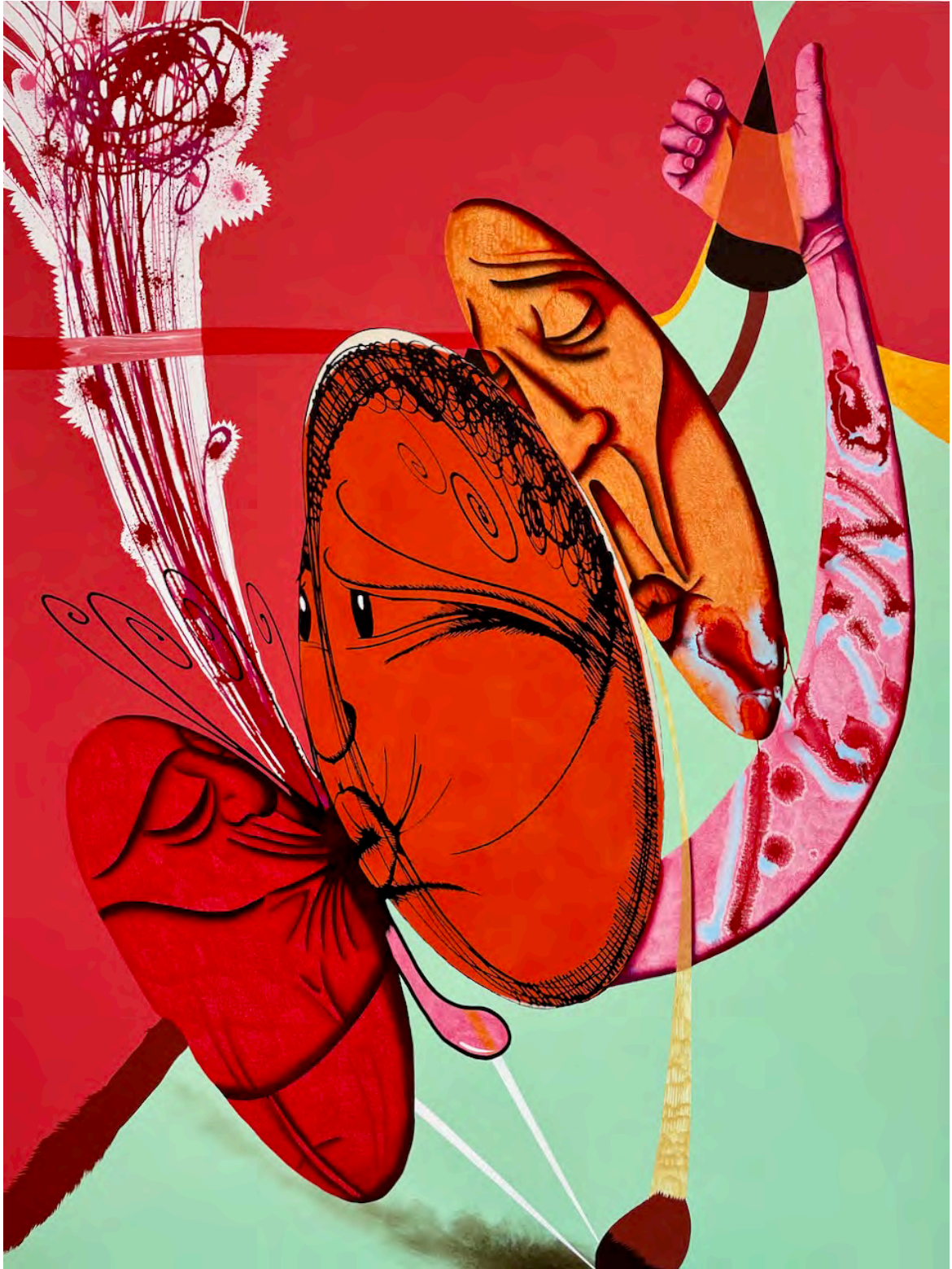
Tom Worsfold Dopamine , 2023 Acrylic on canvas 100 x 75 cm