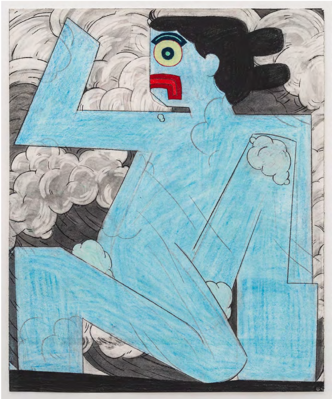
Christina Barrera Nos Encontramos en la Calle II (We Find Ourselves / Each Other on the Street II) , 2020 Chalk Pastel, Charcoal on Paper 36"H x 30.5"W