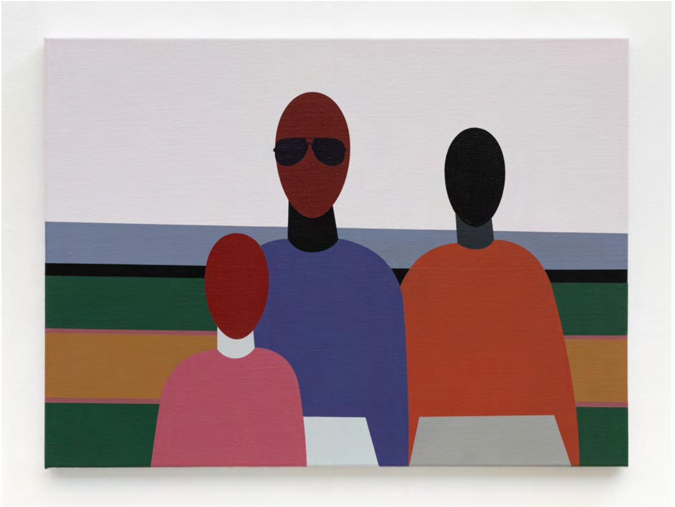
Juan Bolivar Trio, 2018 Acrylic on canvas 48 × 64 cm