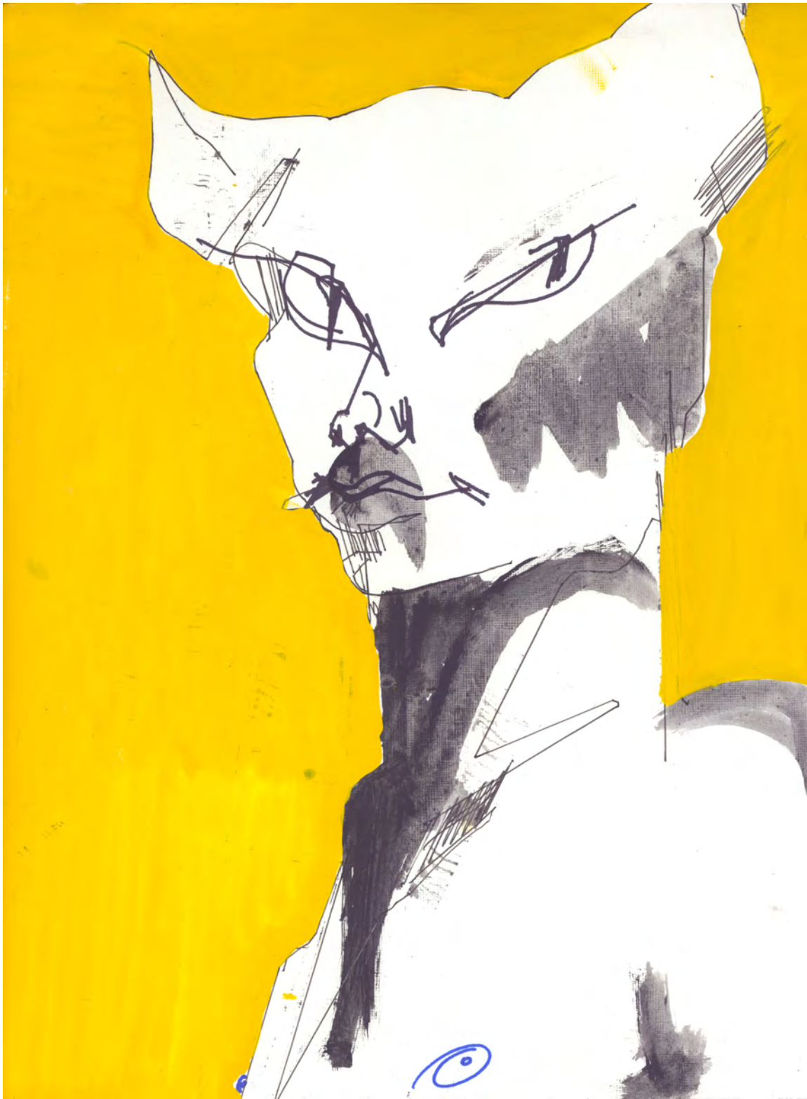
Julie Verhoeven Life aint Pretty, 2023 Acrylic on paper 42 × 29.7 cm