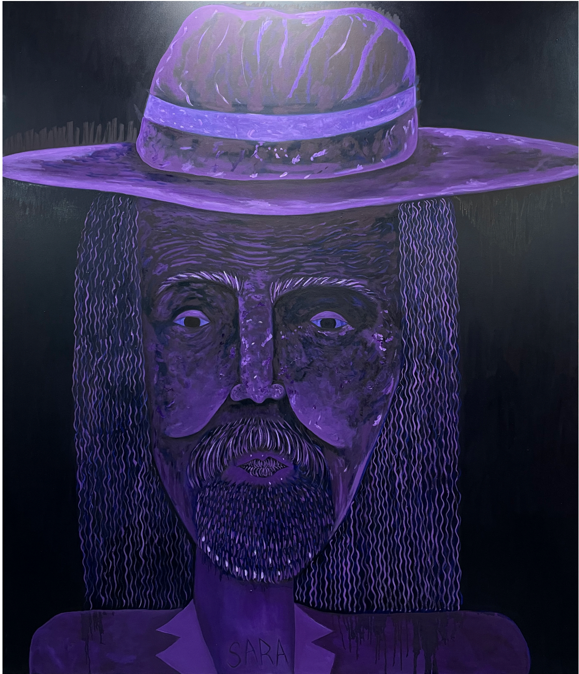
Mark Connolly Portrait of the Undertaker - work in progress - image to be updated Oil on canvas 210 x 180cm