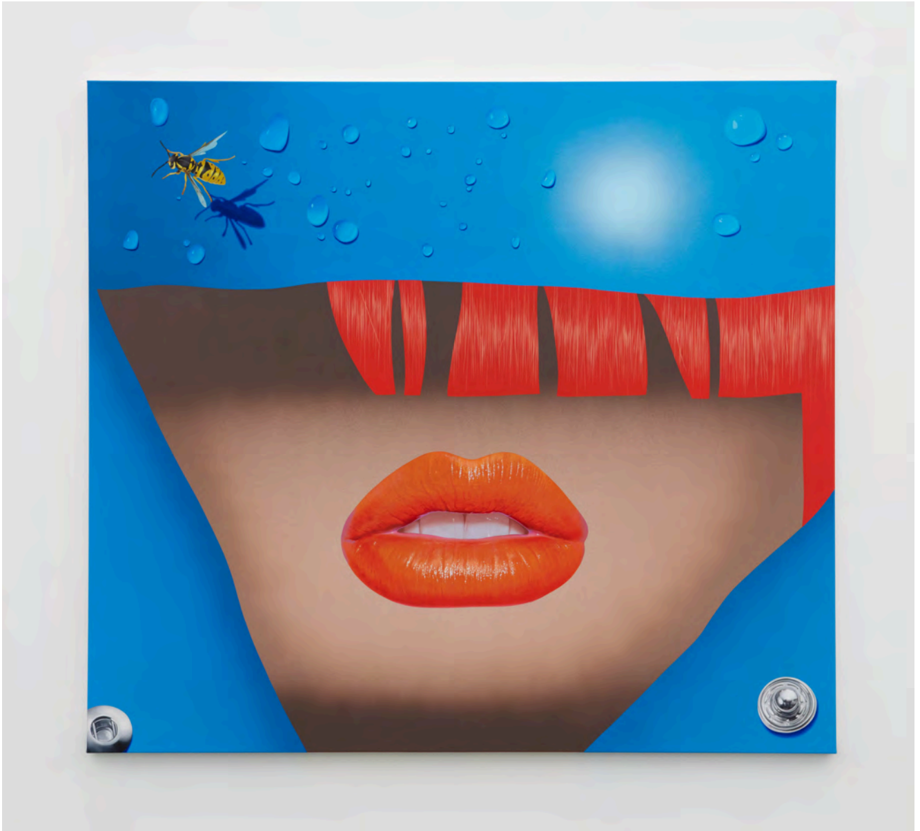
Oli Epp Wet Weather Warning, 2022 Acrylic and Oil on Canvas 180 x 200cm