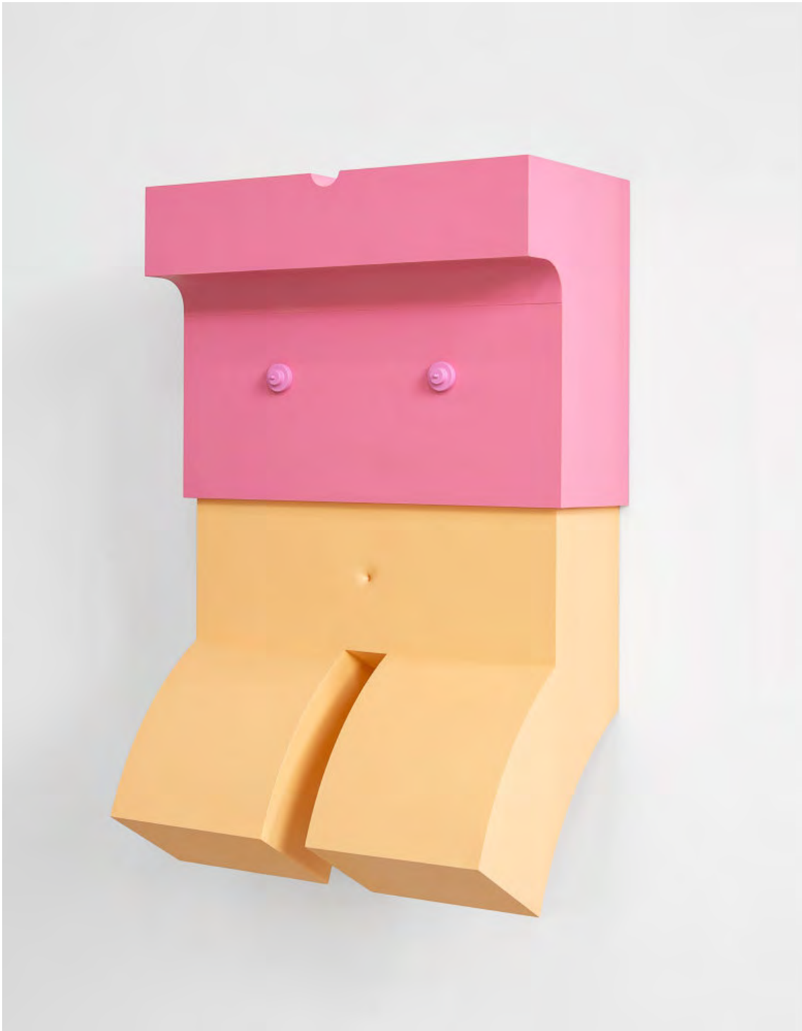
Liam Fallon Core Strength , 2021 Jesmonite, MDF, timber, polyurethane foam, spray paint 118 x 75 x 50cm