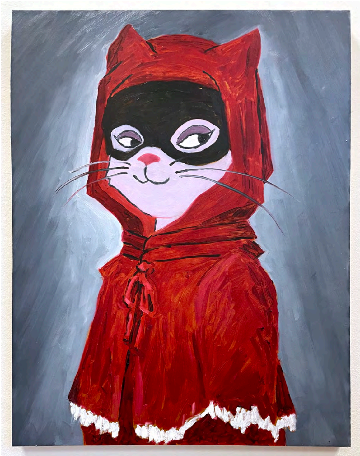
Toby Ursell Milady de Winter, 2022 Oil on panel 64.5 × 50 cm