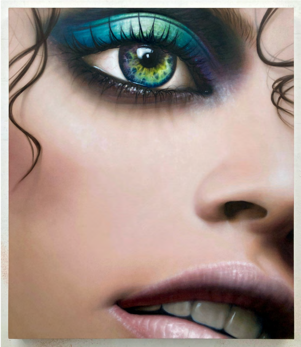
Cyan Dee / Machiko Edmondson Face Painting, 2023 Oil on canvas 107 × 93 cm