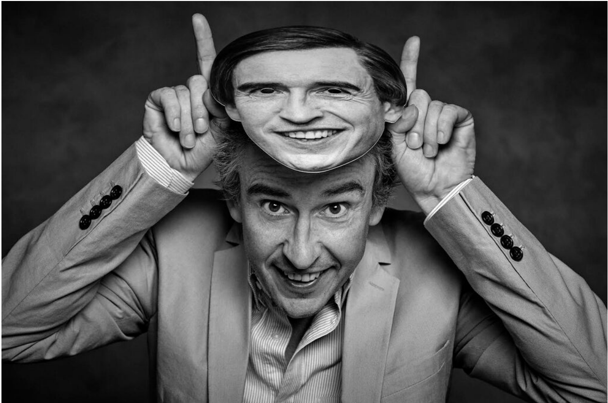
Charlie Gray Steve Coogan, photographed with an Alan Partridge mask for Empire, 2015 Gelatin silver print 26 1/2 × 40 in | 67.3 × 101.6 cm Frame included Edition AP + 1AP