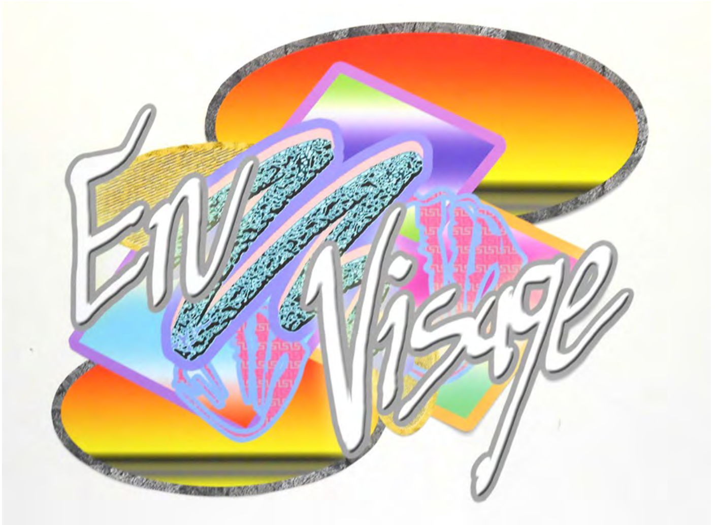
Nicky Carvell En Visage, 2013 Gigital Print on Adhesive Vinyl 76 × 100 cm