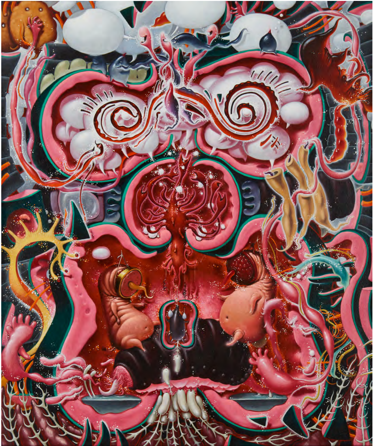
John Greenwood God Save The Homunculus, 2021 Oil on linen 60 x 50 cm