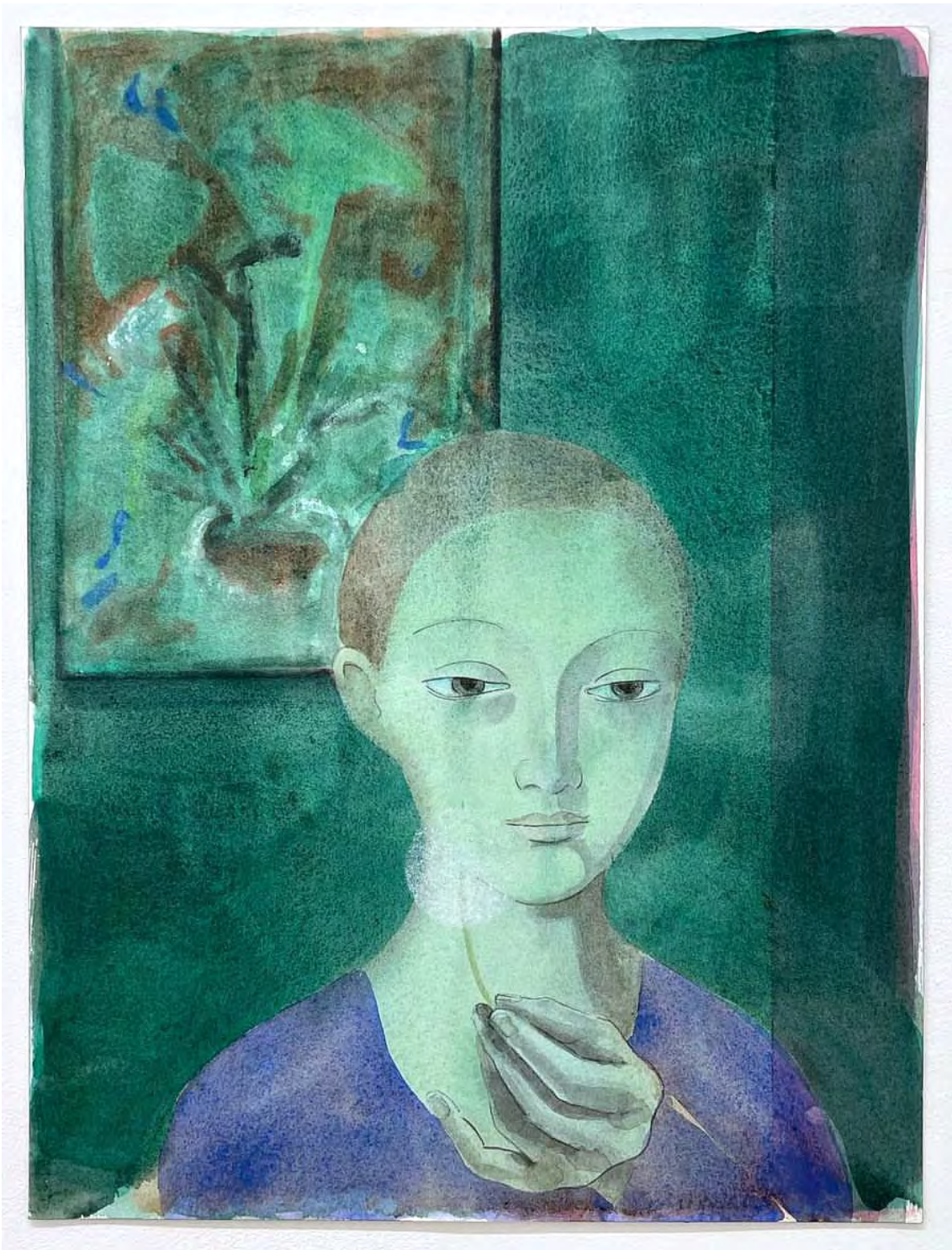
Richard Wathen Duet, 2023 Watercolour on 640gsm Hahnemuhle HP Paper 48 × 36 cm