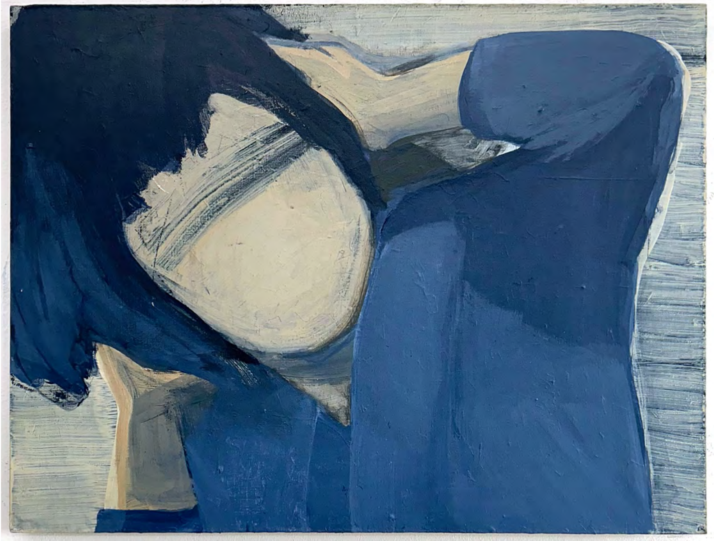
Miho Sato Run Away, 2020 Acrylic on board 46 × 61 cm