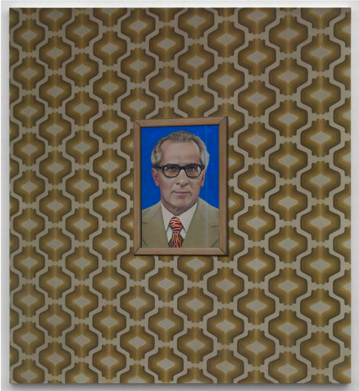
Des Lawrence Vic Allen, 2017 Enamel and oil on aluminium 53.5 × 48 cm